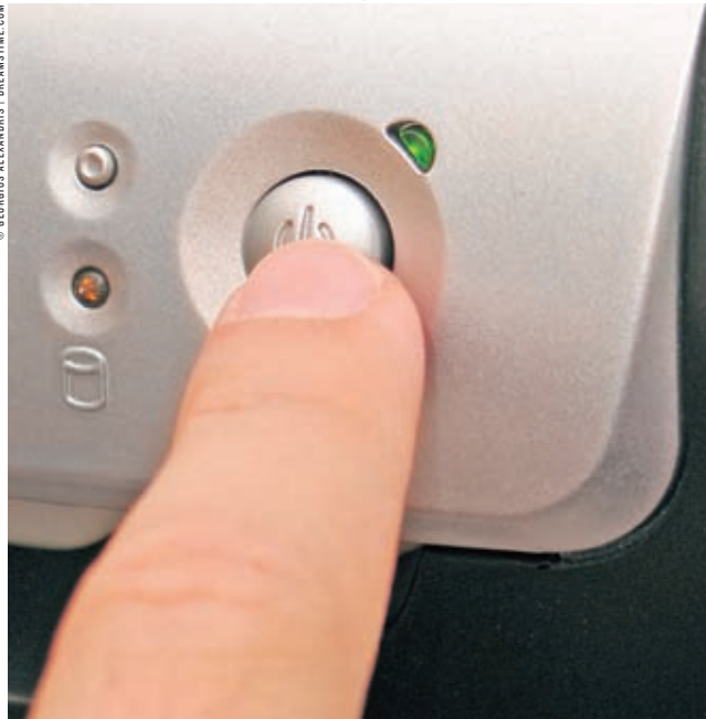
The 'off' button is the key to saving energy.

■ Buying recycled products and instituting recycling programs at your business decreases energy use on the large