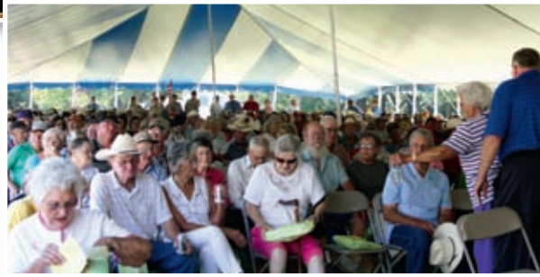
A large number of people, young and old, enjoyed the Health Fair, entertainment and food at the Annual Meeting.