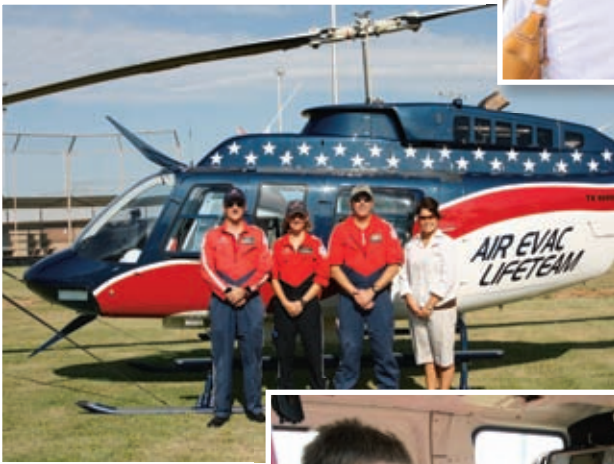
Youngsters attending the meeting jumped at the opportunity to sit in an Air Evac Lifeteam helicopter.