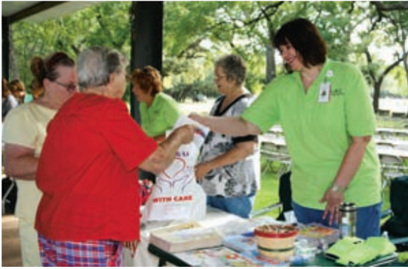
During registration, members took advantage of the opportunity to visit the many booths at the Health Fair.