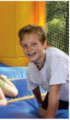
The younger folks attending the 2009 Annual Meeting were treated to their own entertainment in a bounce house.